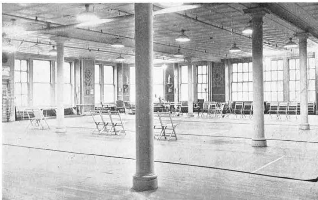
THE WORLD'S LARGEST PRIVATE SALLE D'ARMES

HOME OF THE SALLE SANTELLI THE METROPOLITAN FENCING CLUB THE UNITED STATES FENCING EQUIPMENT CO., INC.